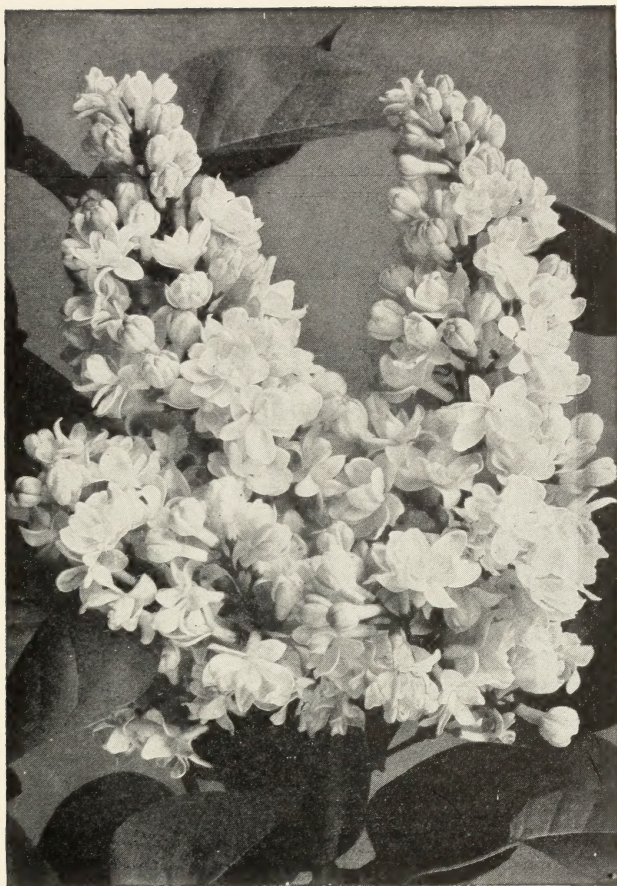
A Fine Double Variety

FOR YOUR GARDENS— THE NEWEST, RAREST AND BEST OF THE RECENT